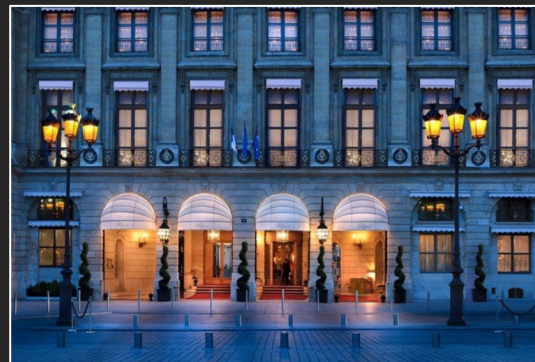
Luxury, from Sin to Market Sector