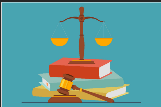
Law and Philosophy