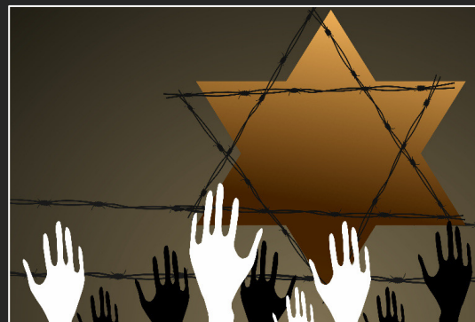
Literature of the Holocaust