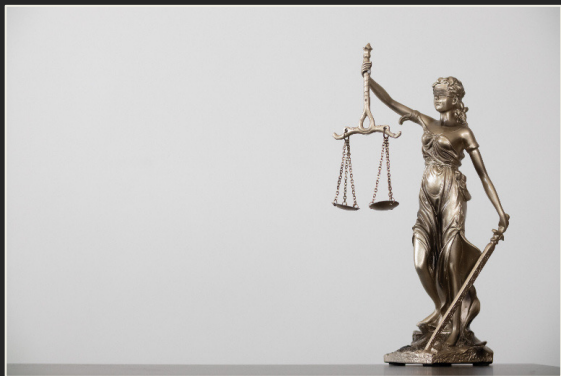
Anger: Sacred and Profane